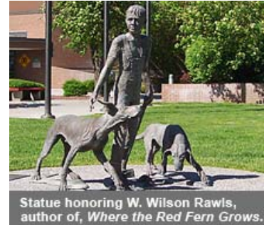
Statue honoring W. Wilson Rawls, author of, Where the Red Fern Grows .