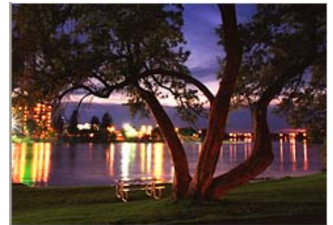
Along the Snake River at night

2707 South 25 th East Idaho Falls, ID 83404 (208) 552-0698