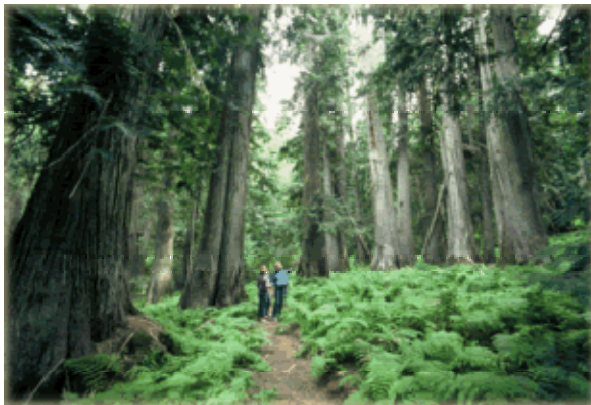
Hobo Cedar Grove Botanical Garden

HELLS GATE STATE PARK , located 35 minutes south of Moscow, includes 200 developed acres that border the Snake River as the gateway into Hells Canyon, famous for being North America's deepest gorge. There is plenty of grassy space for picnicking, camping, fishing, hiking, horseback riding, swimming, and wildlife viewing. The park offers 93 RV/tent camp sites, 8 cabins, and a Lewis & Clark center. Call (208) 799-5015.