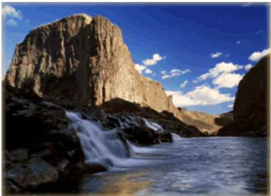
Palouse Falls State Park

LAIRD PARK , located 38 miles north of Moscow, has campsites, a swimming hole, and picnic tables nestled among pine and cedar trees. Take Highway 95 north to Potlatch, and then turn northeast on State Highway 6 for 15 miles. Turn east on Forest Service Road 447 for 3 miles and look for signs.