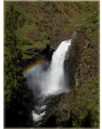
Elk Creek Falls

Elk Creek and nearby Elk Creek Reservoir are favorite spots for catching rainbow and brook trout. Take State Highway 8 to Bovill; follow sign toward Elk River.